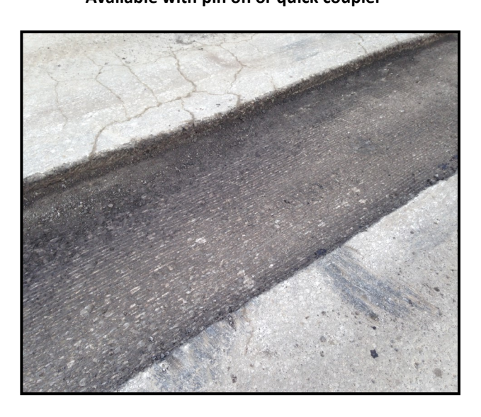
Milled edges provide an excellent bonding surface