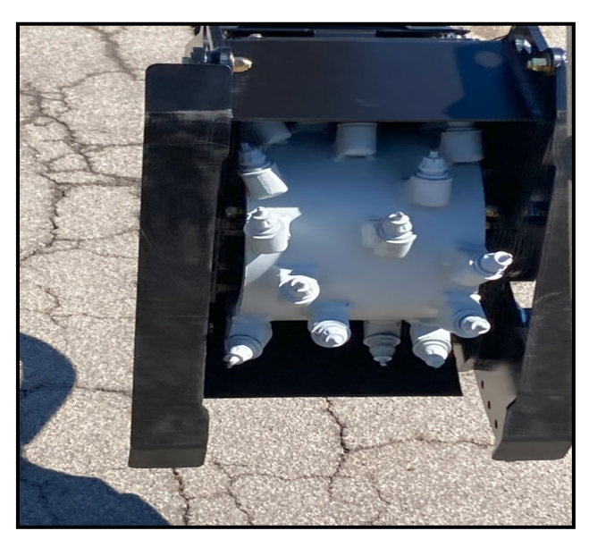
Uses industry standard 20mm cutting teeth