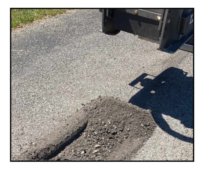
Cut material is suitable for reuse as backfill