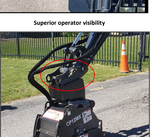
Available with pin on or quick coupler