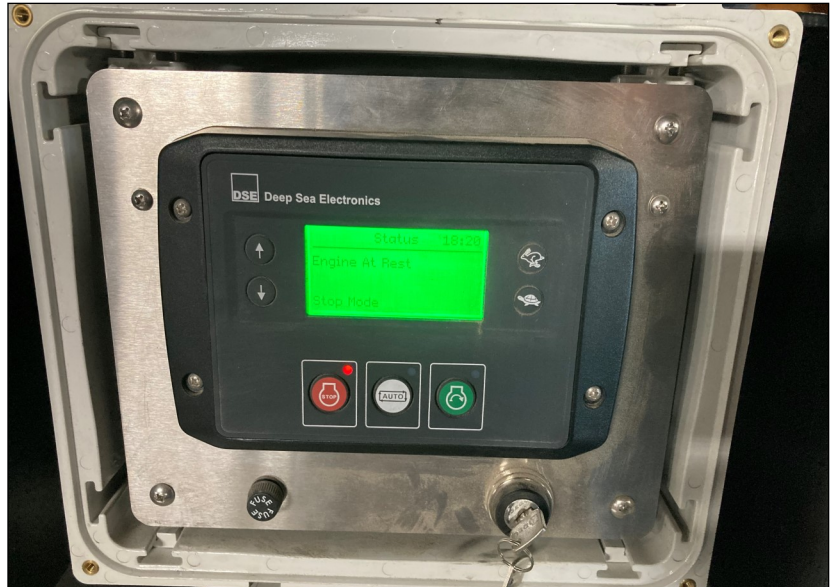
Master control panel includes hour meter