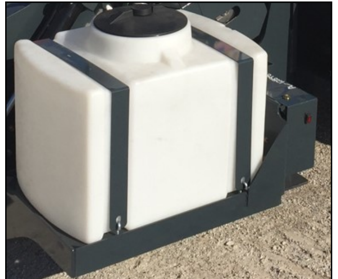
25 gallon pressurized water system