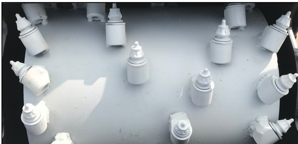
Equipped with 20mm teeth and holders