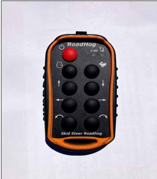
Full function wireless remote